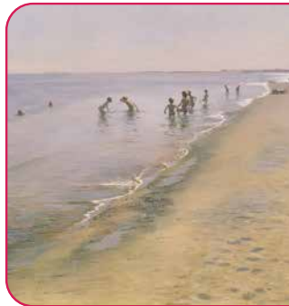
Peder Severin Kroyer A painter from Denmark.