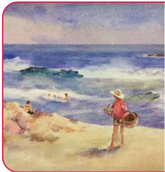
Joaquin Sorolla A painter from Spain, who painted portraits and landscapes.