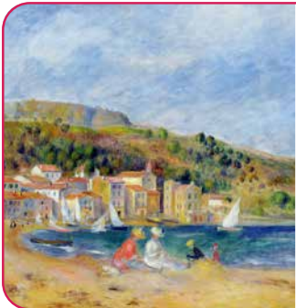
Auguste Renoir An artist from France who was a leading painter in the development of the Impressionist style.