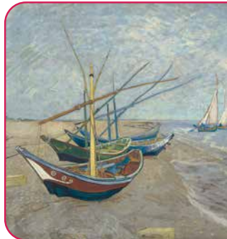
Vincent Van Gogh One of the most famous post-impressionist painters. He was from the Netherlands.